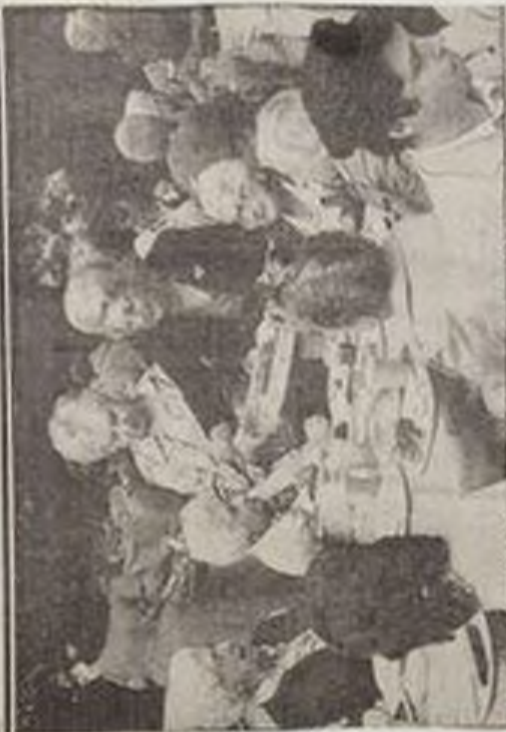
Members of the Penobscot Senior Citizens Club are shown in the photo above. The photo was taken by the Penobscot Senior Citizens Club.

Penobscot Senior Citizens Club The Penobscot Senior Citizens Club is holding a social event at the Penobscot Hotel on Saturday, Dec. 8, at 2:30 p.m. The event will feature a variety of refreshments and entertainment. All members and their guests are invited to attend. For more information, contact the club secretary at 555-1234.