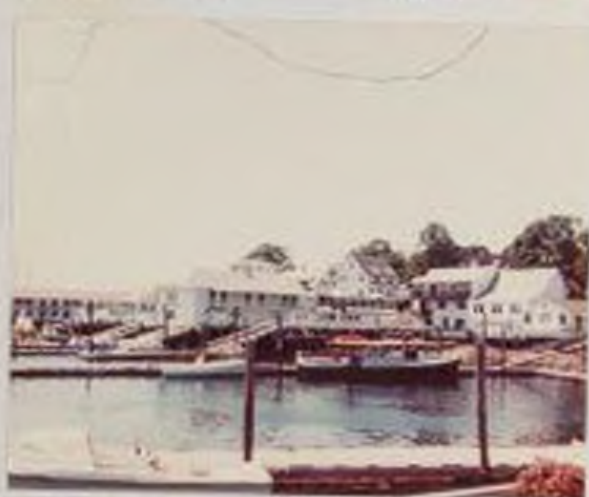
Baith's Bay Harbor April 1983