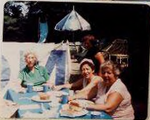
September 1978 from the ...