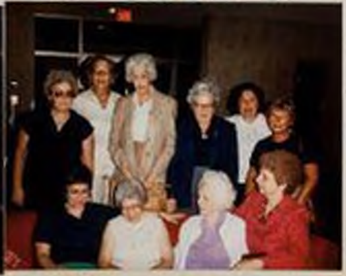
Stevenson Villa 1983 Oct.